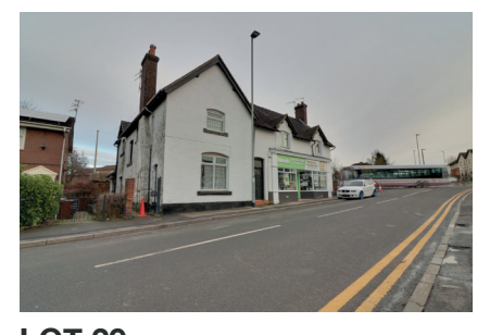
LOT 29 185 Mayne Street, Hanford, Newcastle-under-Lyme, Staffordshire, ST5 7DY