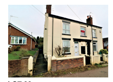
LOT 36 22 Church Street, The Rookery, Stoke-on-Trent, Staffordshire, ST7 4RS