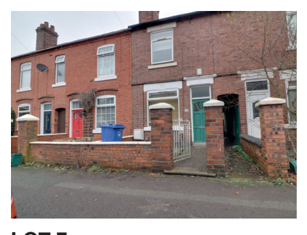
LOT 7 63 Friarswood Road, Newcastle-under-Lyme, Staffordshire, ST5 2EE *Guide Price £77,000 SOLD £94.000