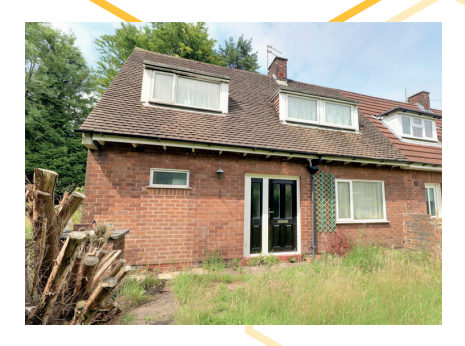
LOT 3 124 Warwick Road, Macclesfield, SK11 8TA *Guide Price £91,000 SOLD £136,000