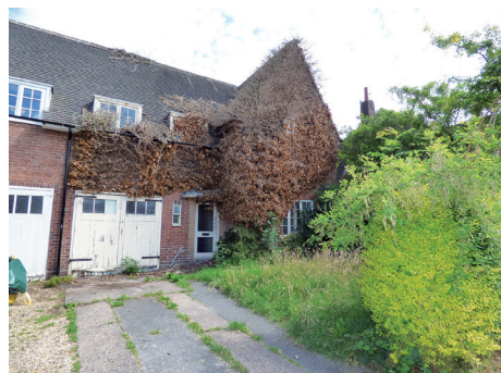
LOT 4 44 Barnfield, Penkull, Stoke-on-Trent, Staffordshire, ST4 5JE *GUIDE PRICE £135,000 plus SOLD £161,000