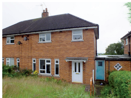
LOT 8 20 Kingsley Road, Talke Pits, Stoke-on-Trent, Staffordshire ST7 1QZ *GUIDE PRICE £70,000 SOLD £86,500