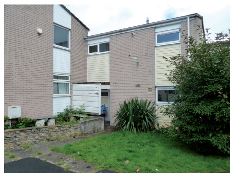
LOT 21 92 Waverley, Woodside, Telford, Shropshire, TF7 5LU *GUIDE PRICE £62,000 plus SOLD £72,500